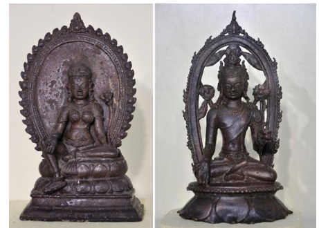
Nalanda Archaeological Museum