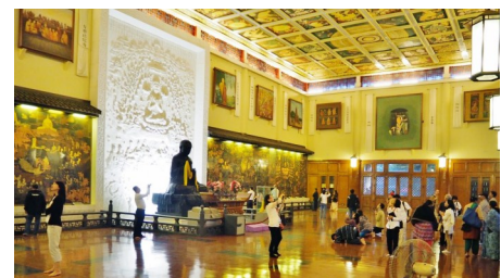
Nava Nalanda Mahavihara