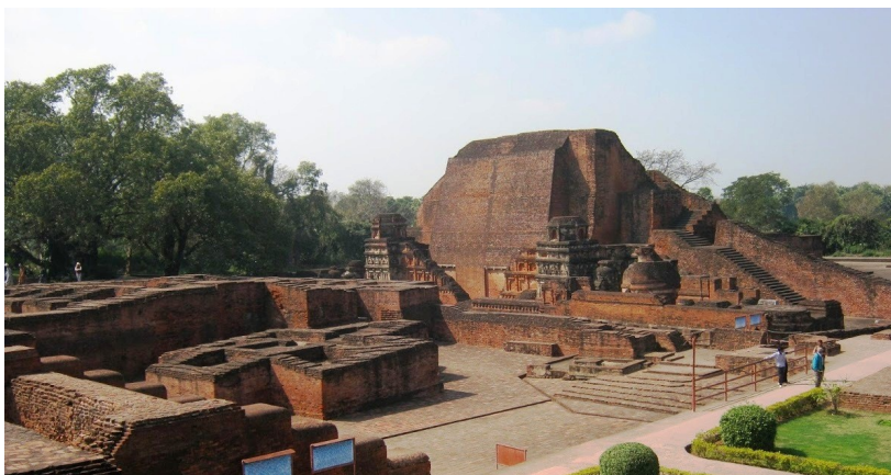
Excavated Remains of Nalanda Mahavihara

Hiuen Tsang Memorial Hall is a new construction in memory of the great Chinese traveller, Hiuen Tsang.