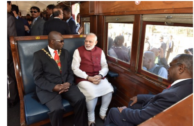
PM on train journey to Pietermaritzburg

The two leaders identified defence, agro-processing, human resource development, infrastructure, manufacturing, mines, minerals, IT, renewable energy, pharmaceuticals, tourism, S&T and financial services as the focus areas for deeper cooperation. South Africa sought India's cooperation in its programme "Operation Phakisa", which focuses on rebuilding its marine and ship-building industry. The leaders emphasized the urgent need for reform of UNSC and international financial systems, and international efforts on counter-terrorism.