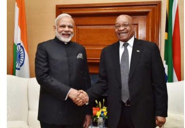
Prime Minister Meets President Jacob Zuma

Prime Minister Shri Narendra Modi paid an official visit to South Africa on July 7-9, 2016. He met President Mr. Jacob Zuma in Pretoria on July 8, 2016. President Zuma recalled India's support in their struggle for freedom and the role of Mahatma Gandhi. He lauded the valuable contribution by the people of Indian descent to the development of South Africa. He welcomed the e-Tourist visa facility extended to South Africa. He appreciated the liberalization of FDI regime and urged South African investors to consider defence, financial and pharmaceutical sectors for investment in India. Prime Minister Modi commended South Africa for extending 10-year multiple-entry visas to business persons from BRICS countries.