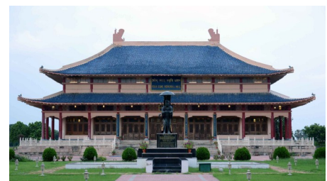
Hiuen Tsang Memorial