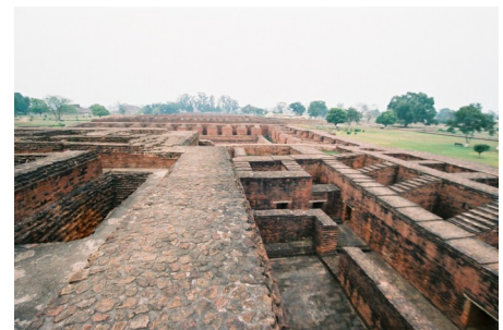
Excavated Remains of Nalanda Mahavihara