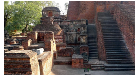
Excavated Remains of Nalanda Mahavihara